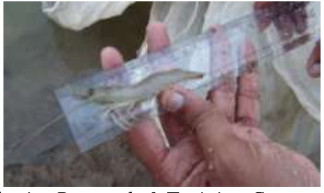
(Fisheries Research & Training Centre, JAU, Mahuva)